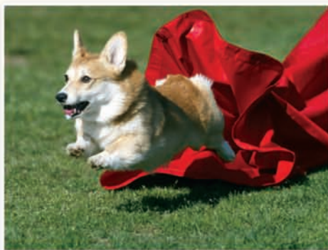
Pembroke Welsh Corgi