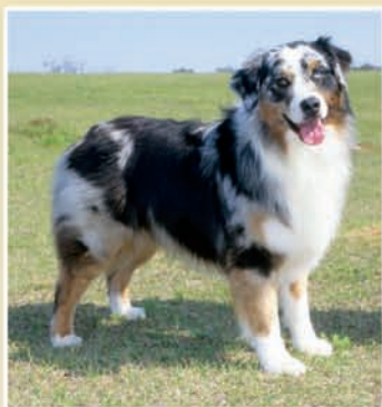
Australian Shepherd