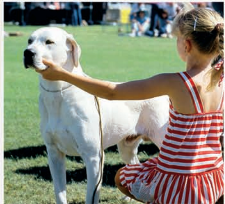
Labrador Retriever AKC Photo Files

No cause is more highly regarded by the American Kennel Club® than maintaining the heritage and future of purebred dogs. The AKC is the only dog registry that automatically incorporates health screening results into its permanent dog records. Dogs certified to be free of hip or elbow dysplasia through the Orthopedic Foundation for Animals (OFA) and dogs certified to be free of eye disease through the Canine Eye Registration Foundation (CERF) have their clearance numbers printed on AKC-certified pedigrees and registration documents. The AKC tracks more than 350,000 DNA profiles in the AKC database. Every dog owner should know their pet's history. The AKC ensures that history stays with us for future generations.