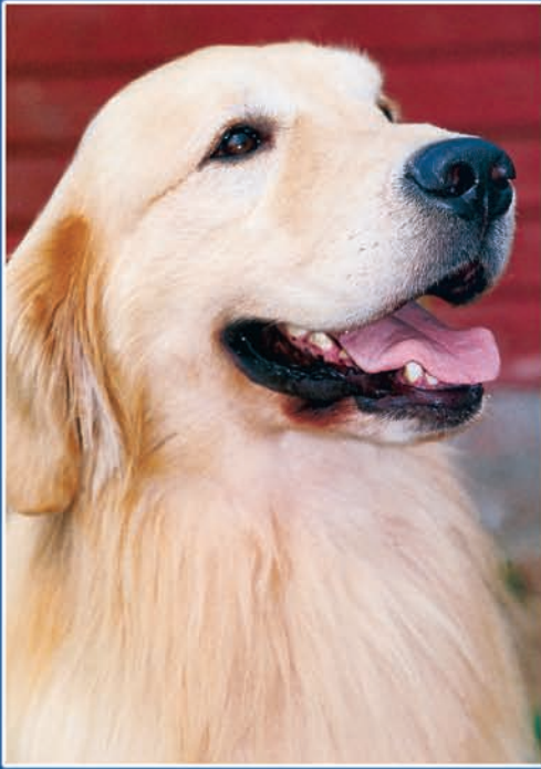
Golden Retriever

You may want a dog for many different reasons. Perhaps you're looking for a jogging companion. Maybe you'd like a therapy dog to join you in visits to hospitals and nursing homes. You may want to participate in the AKC dog show world or enjoy the challenges of other AKC events such as Obedience or Agility. Whatever the reason, your decision to bring a dog into your life is an important