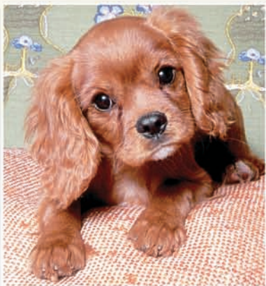
Cavalier King Charles Spaniel

The AKC recognizes more than 150 breeds of purebred dogs. Purebreds are the result of carefully selected, researched and documented breedings. Some breeds originated relatively recently, while others have existed since civilization began.